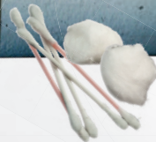
Cotton swabs & makeup pads