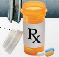
Dispose of medicines safely

! Do not flush unused prescription drugs or over the counter medicines. Visit www.ebmud.com/cleanbay for collection sites.