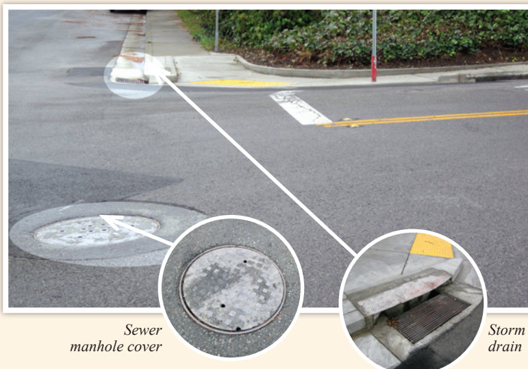
Sewer manhole cover

If you see a manhole overflowing in the street immediately call the District at (510) 524-4667 and we will promptly send a maintenance team to evaluate the situation. If you have any questions about the storm runoff system, call the following numbers: City of El Cerrito (510) 215-4382 and the City of Richmond (510) 231-3011. Residents of Kensington should call their Contra Costa County office at (925) 313-7000. S